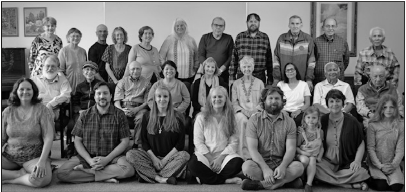
Krotonians, Centennial Photo 2024

And to all of you, Friends of Krotona, who honored our special day and donated precious funds, may your light shine ever brightly! We are forever blessed by your presence and generosity. Thank you! ■